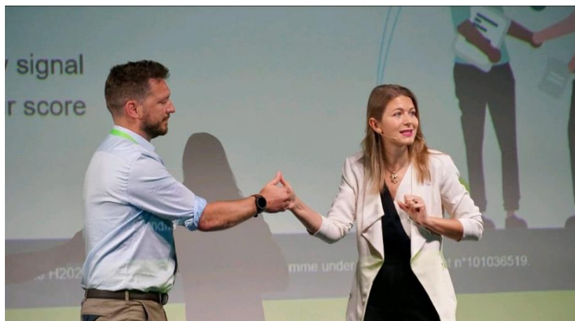
Figure 4: 'Thumb War' Demonstration