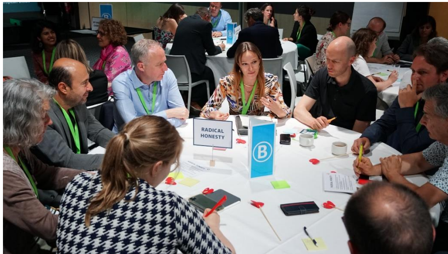
Figure 11: Radical Honesty discussions