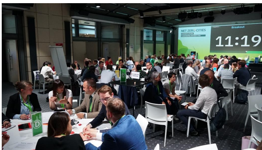
Figure 10: Workshop Sessions

Participants were divided by groups of 12 people to facilitate discussions. Each group had 35 minutes to discuss each topic with the help of a facilitator. For more information on the content of the workshops please see Appendix 1 – Workshop Facilitation Guide.