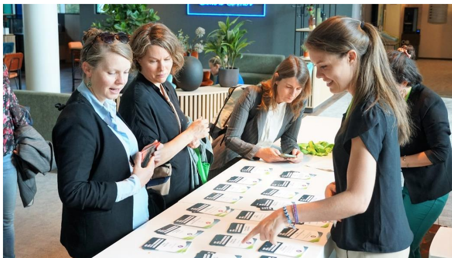
Figure 3: Badges Station