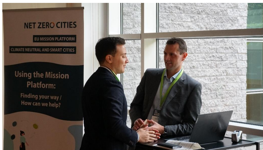
Figure 12: Information Station on using the Mission Platform

The Information Station titles were aligned to the Quick Read Resources that were prepared and shared with the Cities in advance of the Kick Off Event. The titles were also reflected in the themes of the Online Conference Session listed below. This provided a clear content link between the Kick Off Events and the Online Conference.