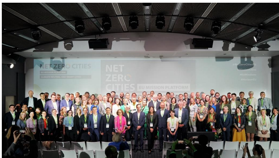
Figure 5: Mission City representatives

To mark the first in person event of the Climate Neutral and Smart Cities Mission, a group photo was organized with one representative from each Mission City before the morning sessions started.