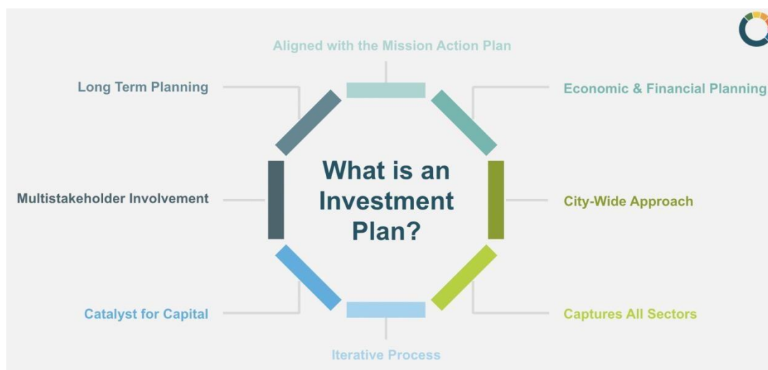
Figure 1: What is an Investment Plan?

Align with the Climate Action Plan: Whilst it should not be mistaken with the Mission Action Plan, the Investment Plan and the Climate Action Plan will be closely aligned. The Investment Plan will build upon the portfolio of actions cities have committed to take within their Action Plans and quantify the capital needs and sources to deliver on these actions. Cities, with the support of NZC partners will undergo an iterative process of developing actions to achieve impact, identify the costs of these actions and source capital to meet these costs. One of the main building blocks in the development of an Investment Plan is the alignment with the Action Plan.