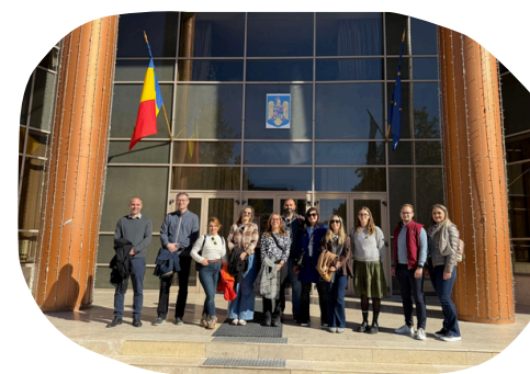
Bucharest District 2 - 28-30 Oct