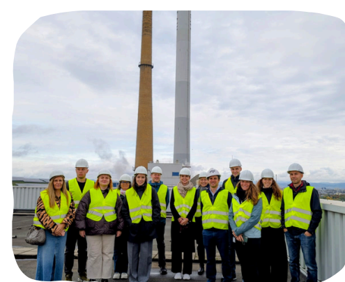
Mannheim 21-23 Oct