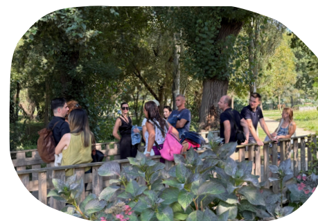
Guimarães 16-18 Sept

3 Mission cities hosted a site visit in 2025: