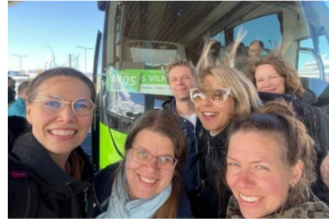
Examples of group journeys to Vilnius for the Cities Mission Conference 2025